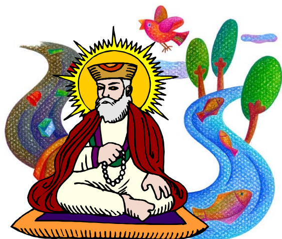
The " River Guru" Somewhere between San Marcos and Seadrift